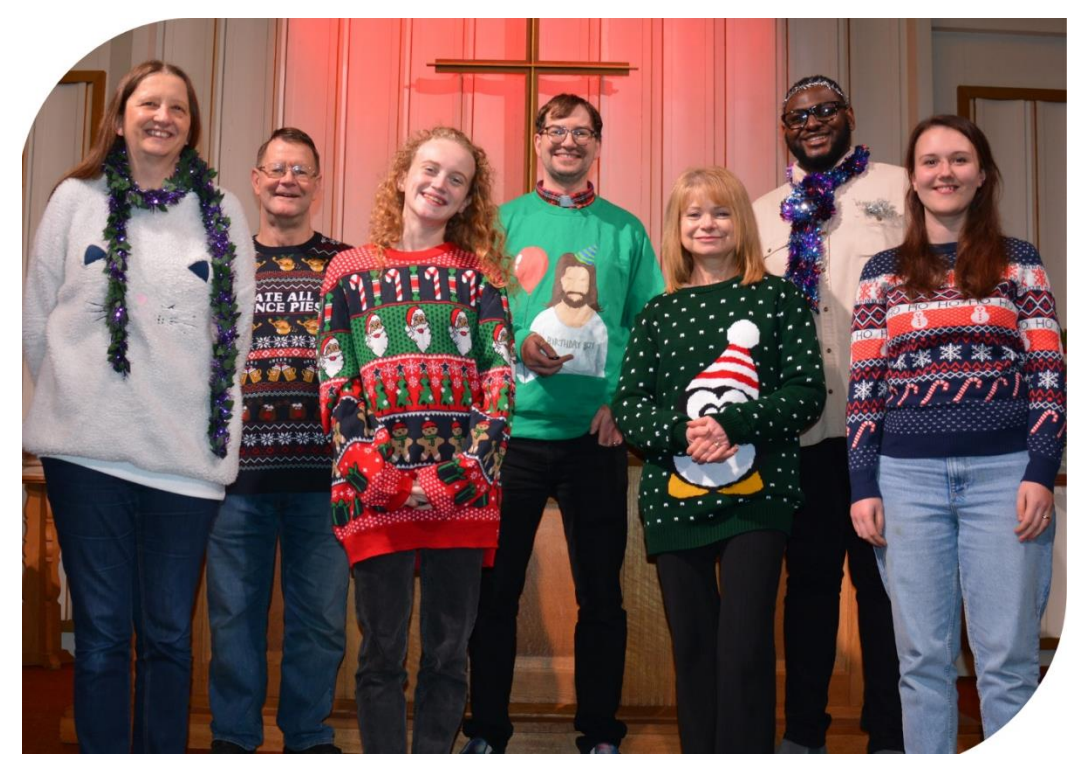
Christ Church Staff Team Christmas 2022

The meeting closed with the grace at 9.15pm.